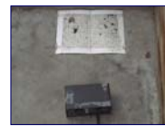
Figure 3. For field cricket tests, ultrasonic devices were set 1 ft away from sticky traps.