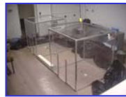
Figure 2. Plexiglas enclosures used for house cricket tests.