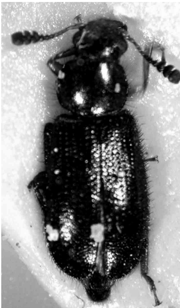
Red-legged ham beetle adult.