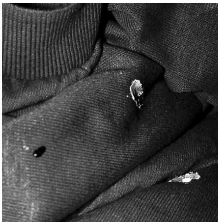
At the Topeka store, RLHB adult and white pupal cases were even found on uniform shirts stored in the office area.

humans). Thus, its potential forensic importance has been studied intensively.