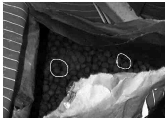
Damaged and/or opened pet food bags are a common source of RLHB infestation. Here, the insects (circled) were visibly infesting the product.