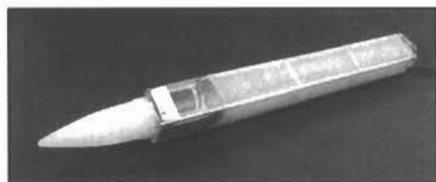
Figure 1. Insector monitoring-system probe.

Shuman: Insector electronic grain probe traps are deployed in bins and elevators after the grain is loaded. Dual infrared-beam sensors in probes detect each insect that falls into a probe's recep-