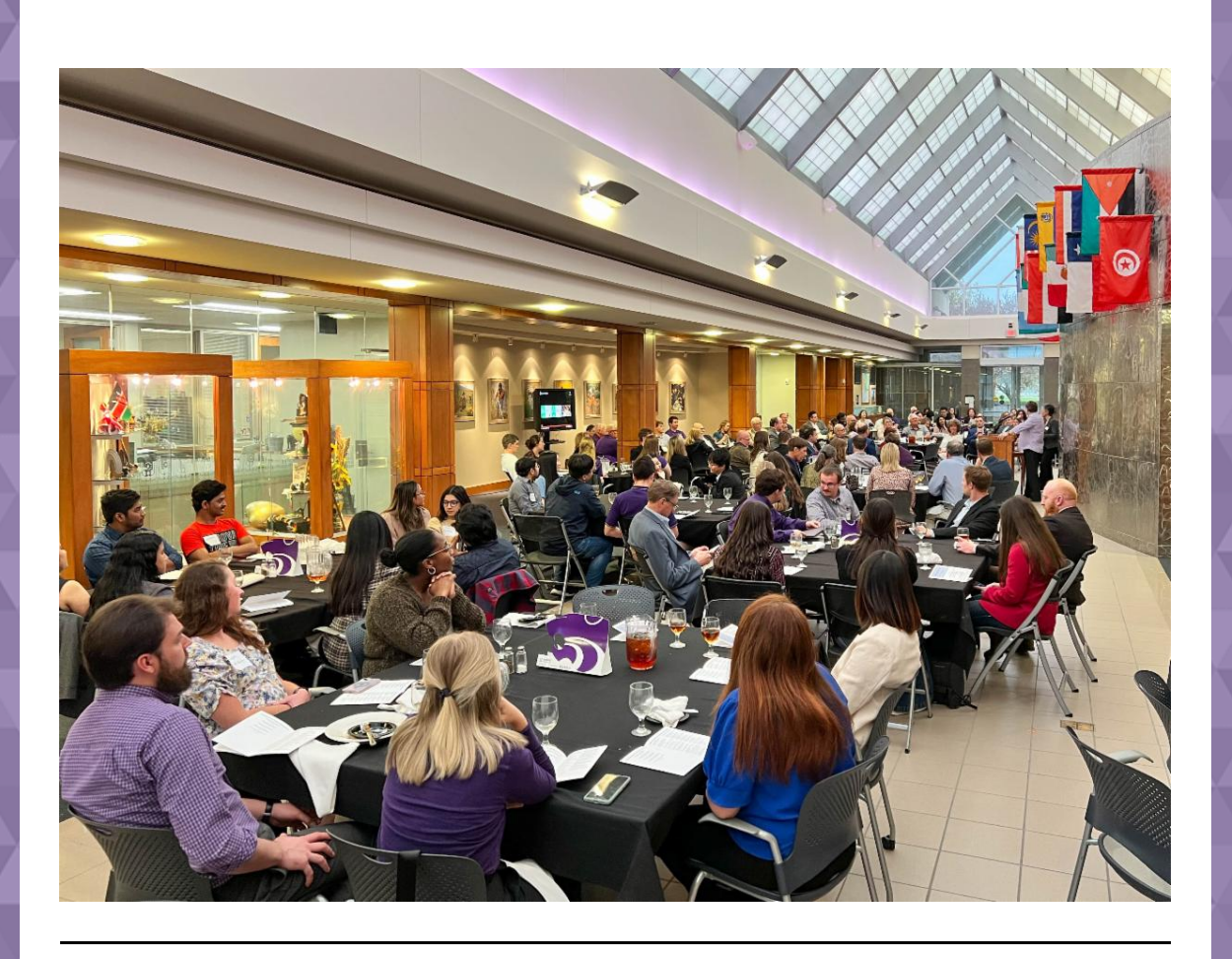
The entire awards listing can be found here: https://www.grains.k-state.edu/newsroom/2023awardsbooklet.pdf