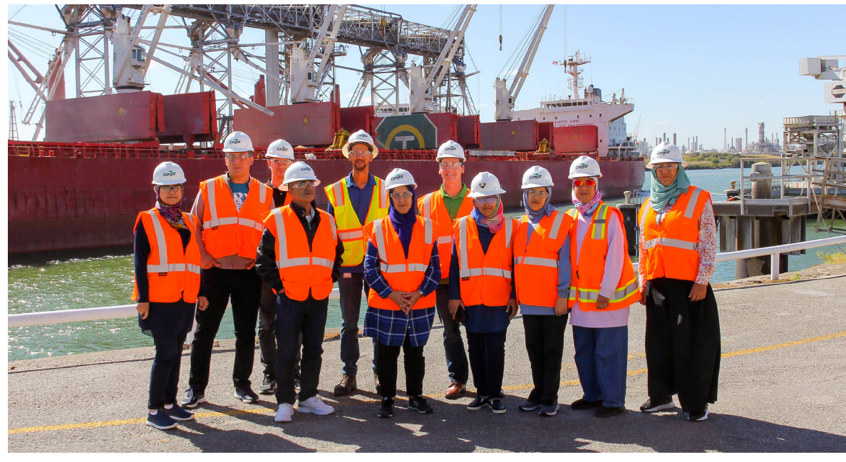
Participants from the USDA Cochran U.S. Wheat Marketing and Promotion for Morocco and Tunisia course visited the Cargill export terminal in Houston, Texas to see the final steps in the process of exporting grain from the United States to international destinations.