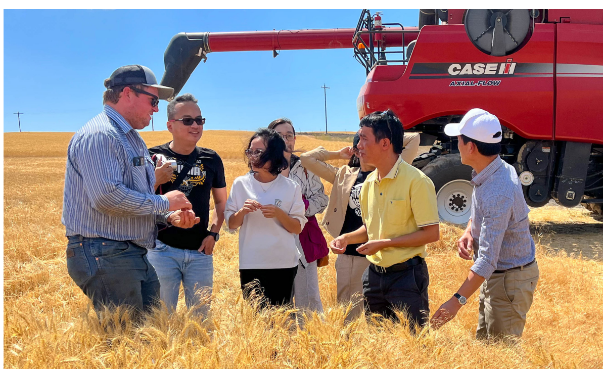
Grain buyers and flour millers from Vietnam learn about soft white wheat harvest on location at the Eakin family farm near Grass Valley, Oregon during a field trip for the USDA Cochran Fellowship Program – U.S. Wheat Promotion for Vietnam course.

IGP-U.S. Wheat Advanced Milling for South Korea