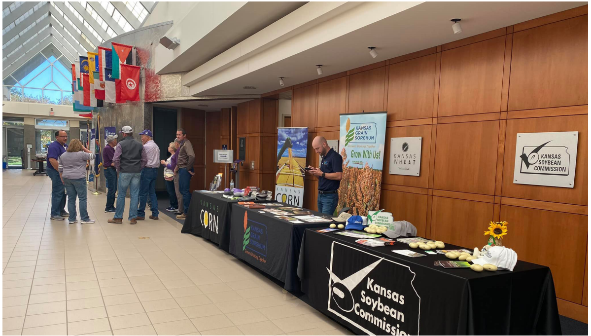
Participants gather to view the exhibits and visit during the Kansas Commodity Outlook and Tailgate event.