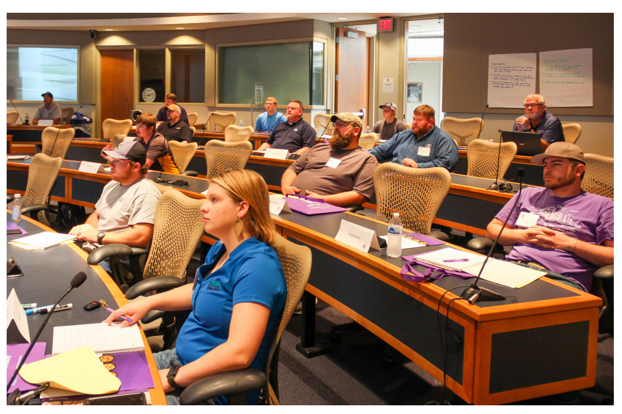
Twenty participants from multiple states and representing various companies attended the four-day Grain Elevator Managers course held during the last week of May.

IGP-KSU Pet Food Formulation for Commercial Production