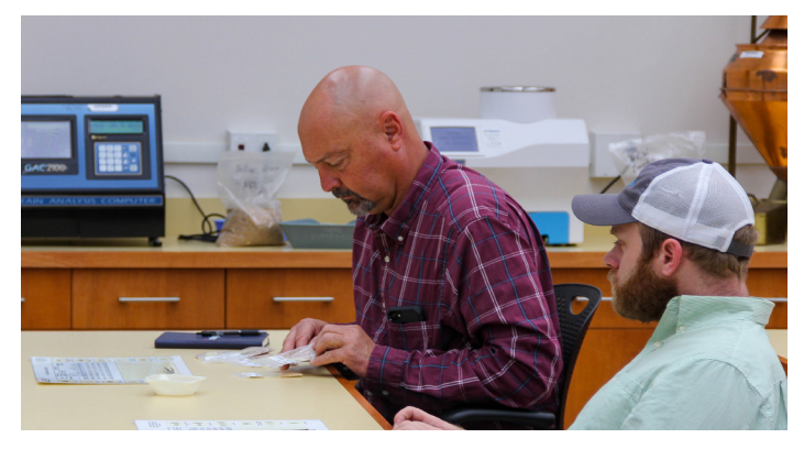
IGP–Indigo Grain Grading participants review various wheat samples as part of the course curriculum.

IGP Institute Department of Grain Science and Industry