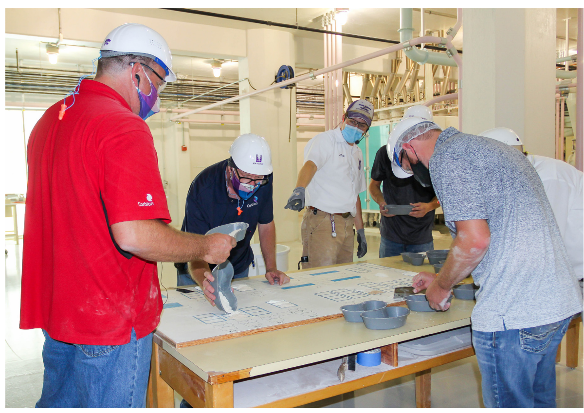
Participants in the IAOM–KSU Introduction to Flour Milling course build a sample board showing the various stages of the milled wheat flour while working with K-State milling faculty in the Hal Ross Flour Mill.